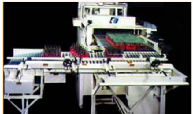
Cases of returnable glass bottles move smoothly on roller conveyor.